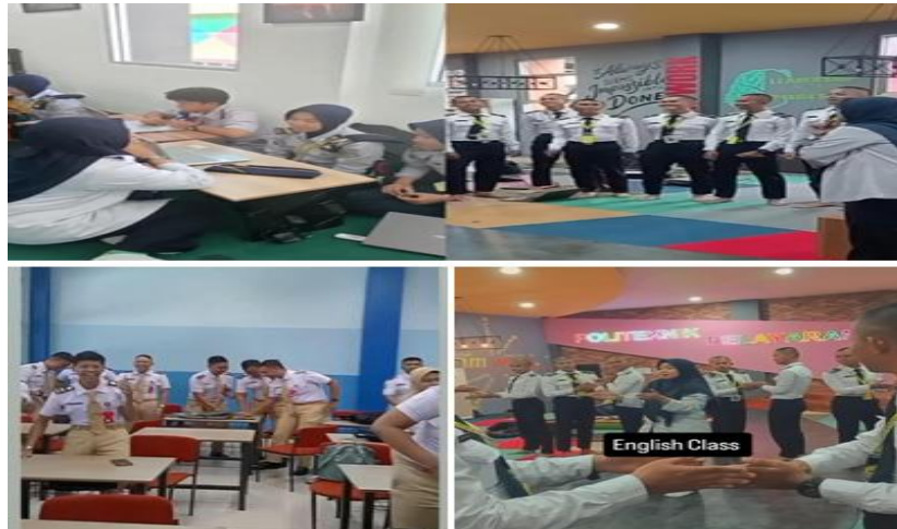
Figure 3. cadets' classroom participation

However, after a semester of ice breaking, participation increased consistently. Towards the end of the semester, more than 70% of cadets were actively involved, either by asking questions, giving opinions, or answering questions. This increase did not happen instantly, but through an accumulative process where ice breaking familiarized cadets to open up from the beginning of class.