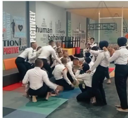
Figure 1. Ice-breaking in the Beginning of the Class to Show the Positive Learning Atmosphere

The application of ice breaking not only serves as a "warm-up" before entering the core material, but also as a means to foster a more lively, dynamic, and interactive classroom atmosphere. This is very important considering that at the beginning of the semester the class atmosphere tends to be passive, many cadets are reluctant to speak in English, and only a few dare to take the initiative to answer questions.