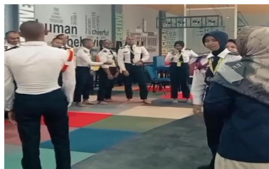
Figure 2. Teachers' Participation in the Classroom during Teaching and Learning

In addition, based on the principle of experiential learning, this activity is an initial means for cadets to learn through direct experience (learning by doing). By participating in fun activities, cadets are encouraged to communicate more actively, dare to express themselves, and foster self-confidence. This is in line with previous research findings which emphasize that a positive classroom atmosphere can increase intrinsic motivation and learning engagement (Kolb et al., 2014) (Iryanti et al., 2024)