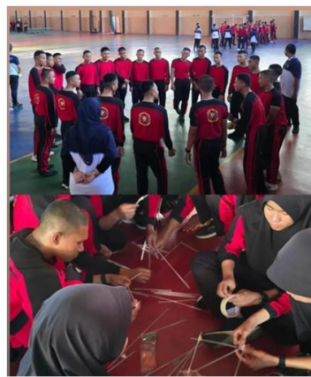
Figure 4. cadets' soft skill development outside of the classroom

Based on the analysis of observations and interviews, the application of experiential learning-based ice breaking not only creates a positive learning atmosphere, but also significantly contributes to the development of six key soft skills in cadets of Surabaya Shipping Polytechnic. The images shown support the empirical evidence that game activities, simulations and group work can train various non-technical skills that are very important in the maritime world.